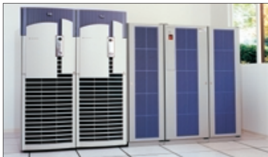
HP Superdome supercomputer with HP Surestore xp512 “Data center in a box” with no single point of failure for life sciences organizations

These services demand diverse communications methods, including Web protocols, voice, video, and document and communications sharing protocols, and they can generate and require increasingly complex data and data structures.